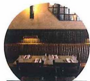
JACKSON + RYE, SOHO

A sexy diner, serving buttermilk pancakes and breakfast cocktails. ( jacksonrye.com )